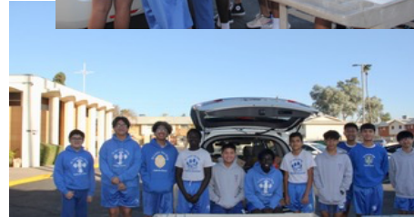
Students from St. Jerome School