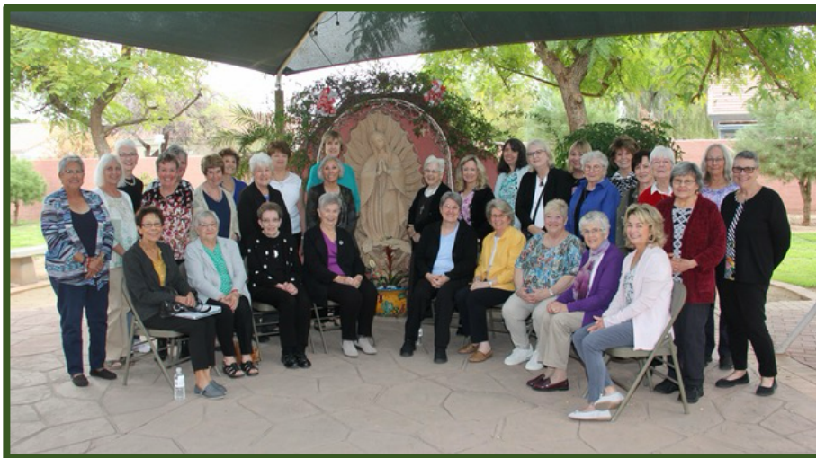
The Christ Child Society of Phoenix enjoyed a wonderful Day of Prayer 2024 at Our Lady of Guadalupe Monastery in Phoenix.

*A PDF of Mary's Way of the Cross was included in the email with this newsletter.