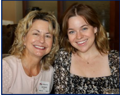
Many attendees reported getting their start in CCS from their mothers