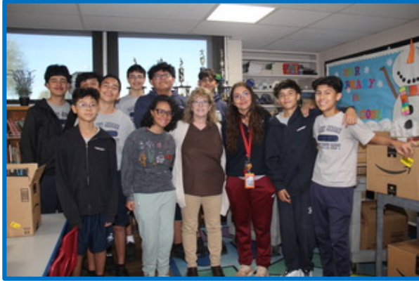
Students from St. Louis the King School